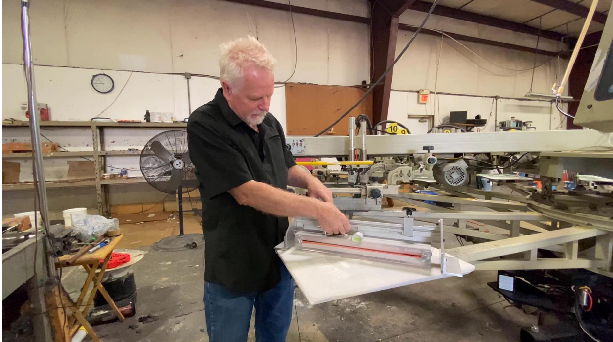
Attach the Frame Level to the PLG, manually with squeegee clamps.