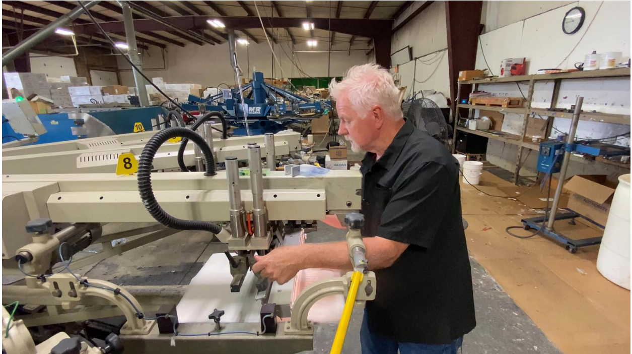
If off, adjust the front to back and side-to-side as you would a squeegee until the PLG is showing level.