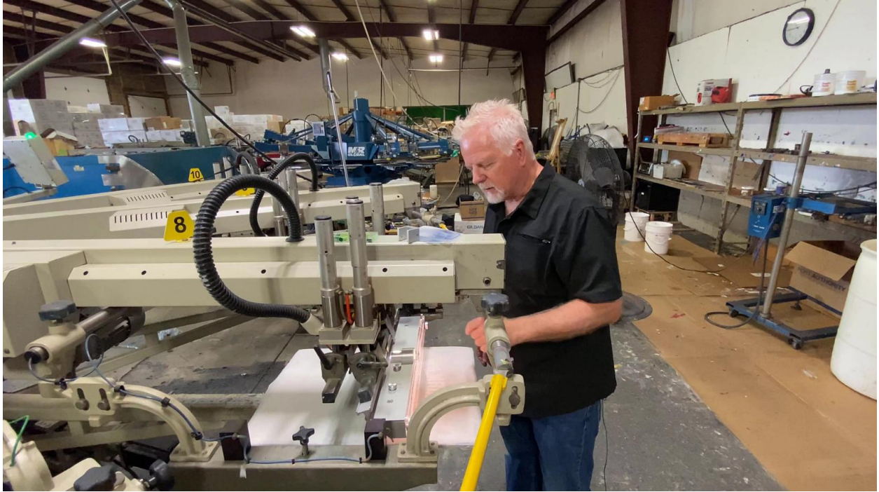
Push the button on top next to the top level gauge to turn it on to check the level of the PLG.